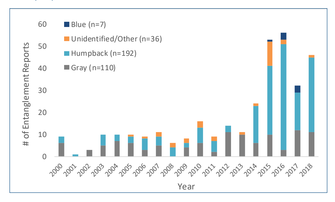
Figure 1. Confirmed U.S. West Coast whale entanglements by year and species, 2000 to 2018. In the legend, "n" represents the total number of that species confirmed entangled in the 19-year period.

Alaska. They travel along British Columbia and the U.S. West Coast states of Washington, Oregon, and California, to their wintering breeding grounds in Mexico; returning to Alaska from February to June. Humpback whales found off the U.S. West Coast generally migrate south from foraging grounds along the coast to their winter breeding grounds in Mexico and Central America in the fall months, although some individuals may remain farther north.