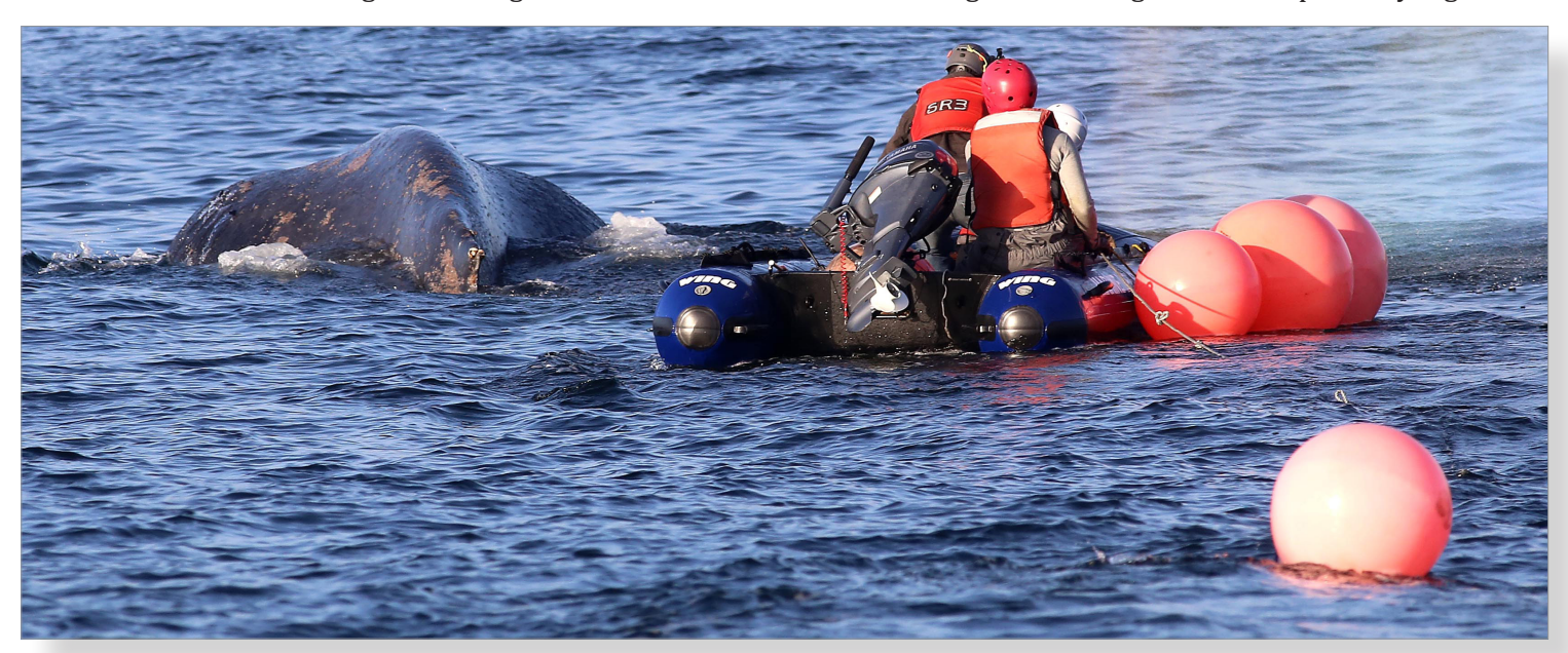
Trained team uses large buoys as part of response in order to assess and potentially remove entanglement from humpback whale. NMFS MMHSRP Permit #18786-03

The higher number of reported entangled whales off the coast of California relative to other states may reflect an increased likelihood of sighting and reporting due to high recreational and commercial activity. For example, Monterey Bay is known to be a preferred area that whales frequently visit during migrations, and this area is also densely populated with many people recreating on the water in the bay; therefore, there may be more entanglement sightings than in other areas along the coast. Successful public outreach in recent years on how to report entanglements may also contribute to locally higher reporting rates. Although the predominance of entangled whales reported from California in 2018 is consistent with historical patterns, the number of reports from Washington and Oregon was exceptionally high