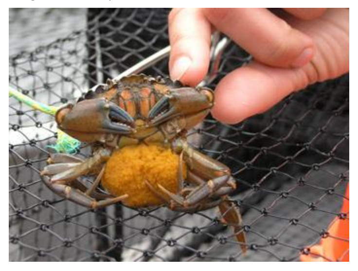
Figure 9.The European green crab is a voracious invasive species in the Pacific Northwest, but is not known to occur in Alaska. The hardworking staff of HCD intend to keep it that way.

is a UAA project that was submitted to the North Pacific Research Board for funding through their grant process. HCD staff have collaborated with UAA by providing review of a number of species draft rankings and assessments to the Research Board. Participation from the community on this issue is key; HCD staff have asked the NPFMC for engagement of the commercial fishing industry and continue to explore opportunities for community outreach about marine invasive species. Notably, HCD staff are partnering with the Smithsonian Environmental Research Center, NOAA International and the Aleut Community of St. Paul Island to introduce marine invasive species community monitoring via the Plat Watch Project through the education Bering Sea Days, planned for October 2017. The event will establish a new Arctic gateway marine monitoring station and provide educational instruction on invasive species.