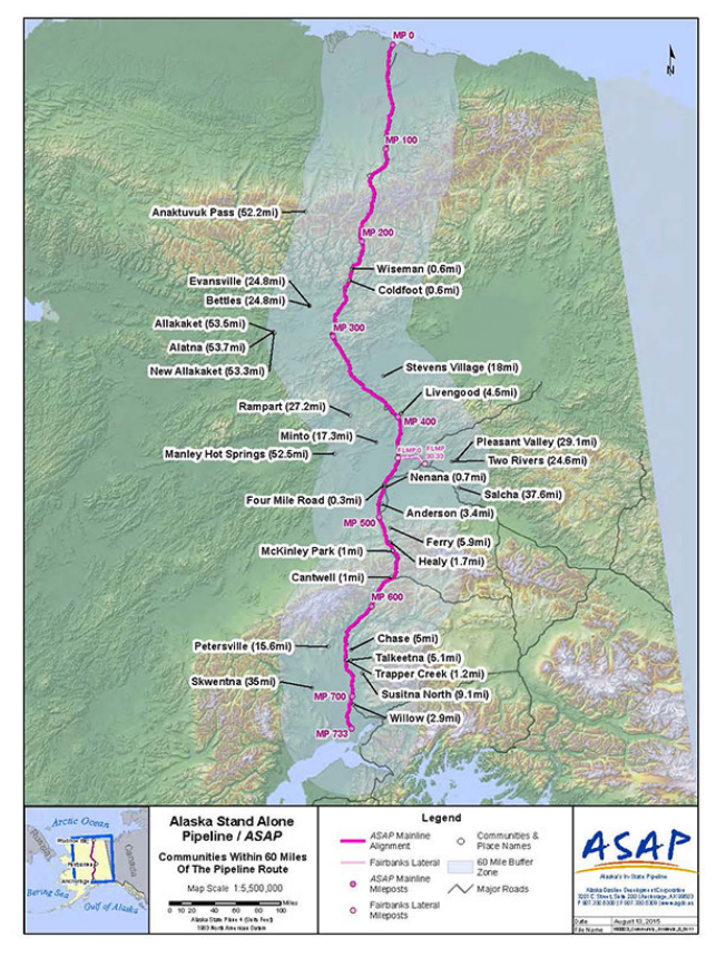
Figure 4. Map of Proposed Alaska Stand Alone Pipeline. The 733-mile low–pressure LNG pipeline would run from Prudhoe Bay to Point Mackenzie, with a 30-mile lateral line between the main pipeline and Fairbanks.