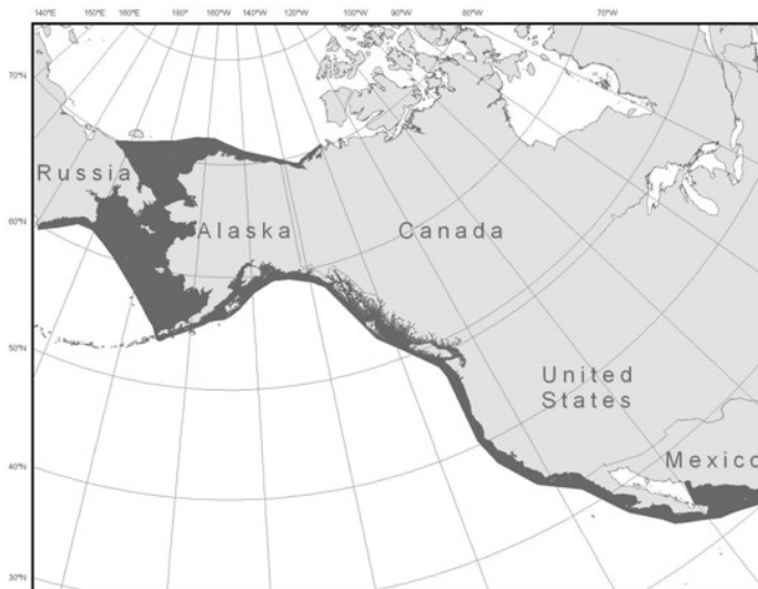
Figure 35. Approximate distribution of the Eastern North Pacific stock of gray whales (shaded area). which

Gray whales formerly occurred in the North Atlantic Ocean (Fraser 1970, Mead and Mitchell 1984), but this species is currently found only in the North Pacific (Rice et al. 1984, Swartz et al. 2006). The following information was considered in classifying stock structure of gray whales based on the phylogeographic approach of Dizon et al. (1992): 1) Distributional data: two isolated geographic distributions in the North Pacific Ocean; 2) Population response data: the eastern North Pacific population has increased, and no evident increase in the western North Pacific; 3) Phenotypic data: unknown; and 4) Genotypic data: unknown. Based on this limited information, two stocks have been recognized in the North Pacific: the Eastern North Pacific stock, which lives along the west coast of North America (Fig. 35), and the