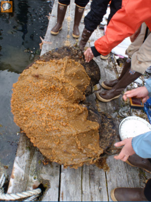
Didemnum vexillum , colonial tunicate discovered in Sitka and infesting a large area of the Georges Banks fishing grounds