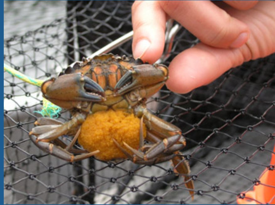
European Green Crab: An Invasive Species Moving North Towards Alaska