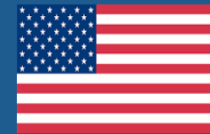
United States of America