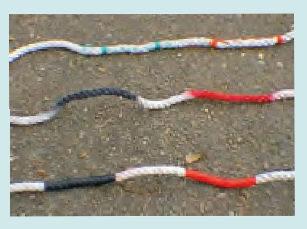
Examples of gear marking methods.

THREE 12 inch (30.48 cm) colored marks: one at the top of the buoy line, one midway along the buoy line, and one at the bottom of the buoy line.