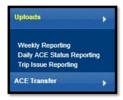
Figure 1: Accessing the Sector Weekly Trip Issue Reports Form Using the SIMM Quick Access Menu

SIMM opens the Sector Weekly Trip Issue Reports page, as seen in Figure 2.