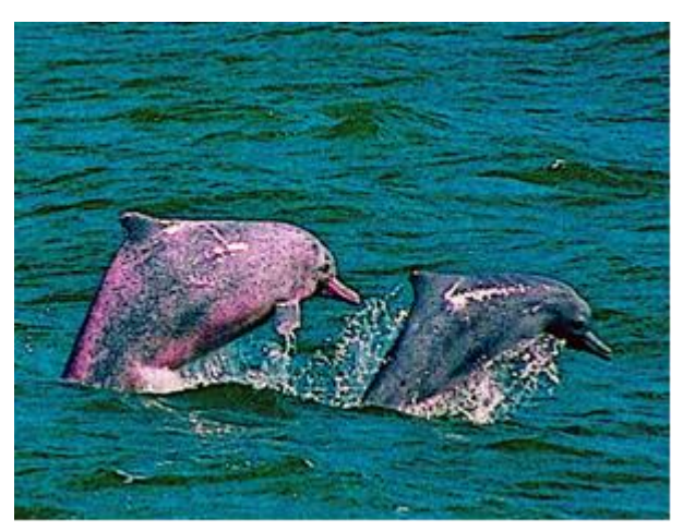
March 9, 2016

Petition to List the Taiwanese Humpback Dolphin (Sousa chinensis taiwanensis) under the Endangered Species Act